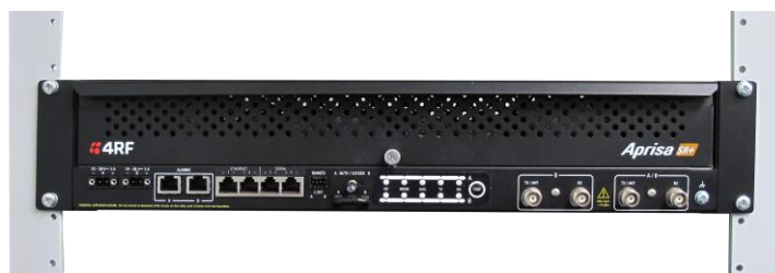
Rack mounted Aprisa SR+ Protected Station without duplexer

The Aprisa SR+ Protected Station is designed to mount in a standard 19" rack.