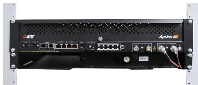
Rack mounted Aprisa SR+ Protected Station with duplexer

The Aprisa SR+ Protected Station has an earth connection point on the bottom right of the chassis. Use the supplied M4 screw to earth the enclosure to a protection earth.